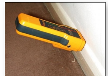
Moisture Meter Inspection